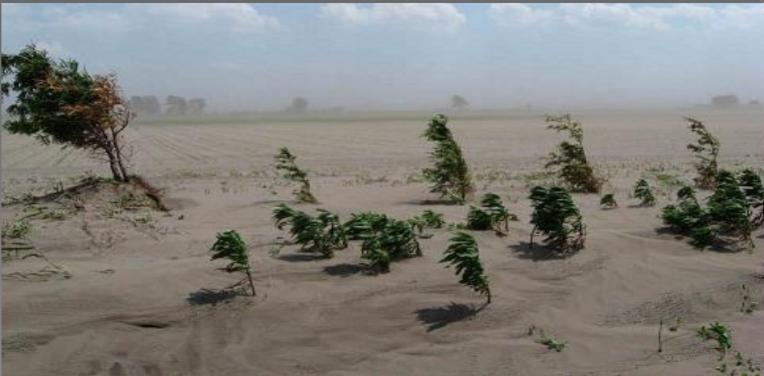
Figure 2. The erosive force of wind on an open field.