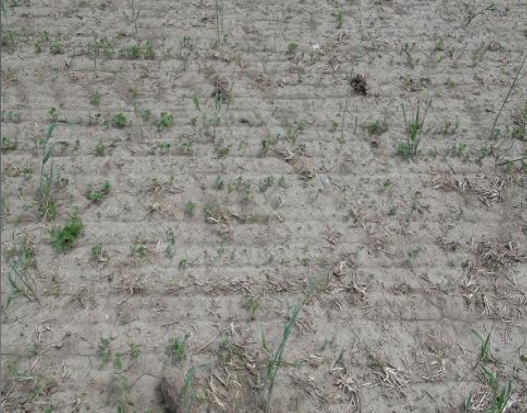
Figure 7. Wind erosion can be severe on long, unsheltered, smooth soil surfaces.

Wind erosion occurs in susceptible areas of Ontario but represents a small percentage of land – mainly sandy and organic or muck soils. Under the right conditions it can cause major losses of soil and property ( Figure 7 ).