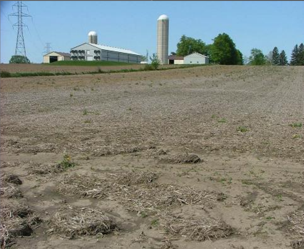
Figure 3. The accumulation of soil and crop debris at the lower end of this field is an indicator of sheet erosion.

Sheet erosion is the movement of soil from raindrop splash and runoff water. It typically occurs evenly over a uniform slope and goes unnoticed until most of the productive topsoil has been lost. Deposition of the eroded soil occurs at the bottom of the slope (Figure 3) or in low areas. Lighter-coloured soils on knolls, changes in soil horizon thickness and low crop yields on shoulder slopes and knolls are other indicators.