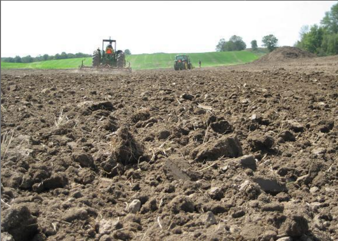
Figure 8. Tillage erosion involves the progressive down-slope movement of soil.