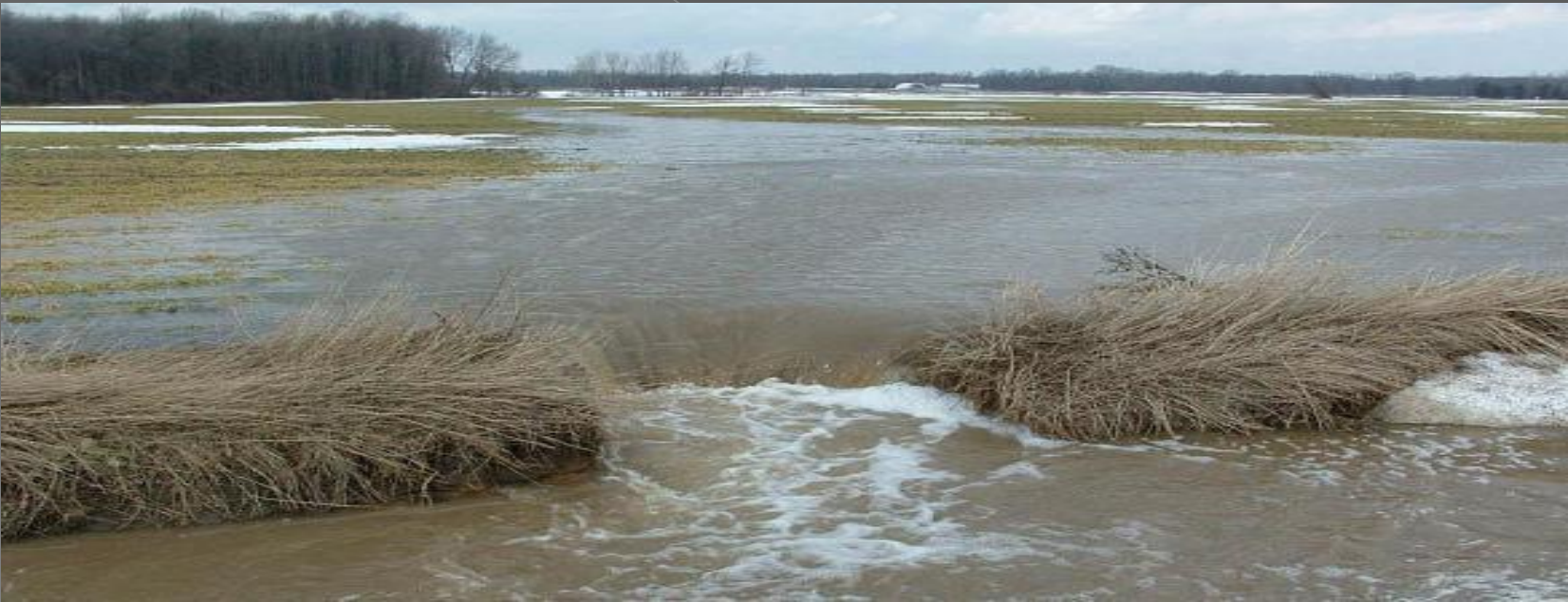
Figure 1. The erosive force of water from concentrated surface water runoff.