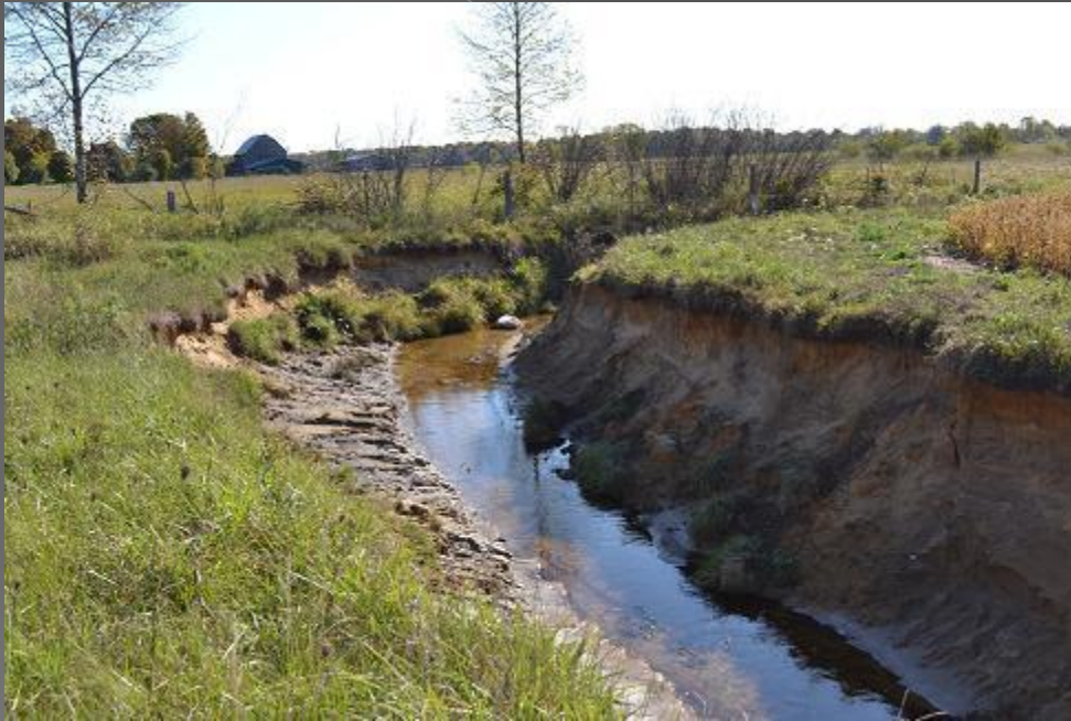
Figure 6. Bank erosion involves the undercutting and scouring of natural stream and drainage channel banks.

Natural streams and constructed drainage channels act as outlets for surface water runoff and subsurface drainage systems. Bank erosion is the progressive undercutting, scouring and slumping of these drainageways ( Figure 6 ). Poor construction practices, inadequate maintenance, uncontrolled livestock access and cropping too close can all lead to bank erosion problems.