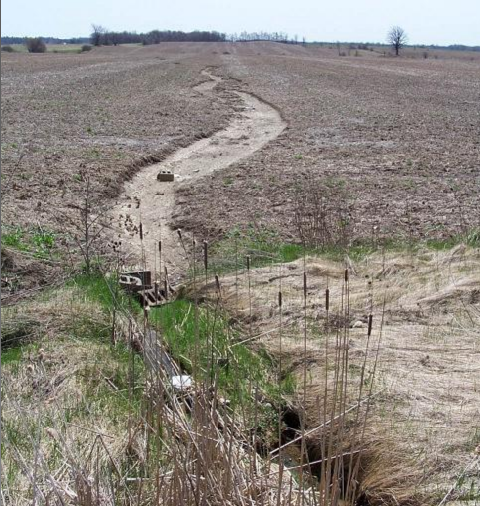
Figure 4. The distinct path where the soil has been washed away by surface water runoff is an indicator of rill erosion.

Rill erosion results when surface water runoff concentrates, forming small yet well-defined channels ( Figure 4 ). These distinct channels where the soil has been washed away are called rills when they are small enough to not interfere with field machinery operations. In many cases, rills are filled in each year as part of tillage operations.