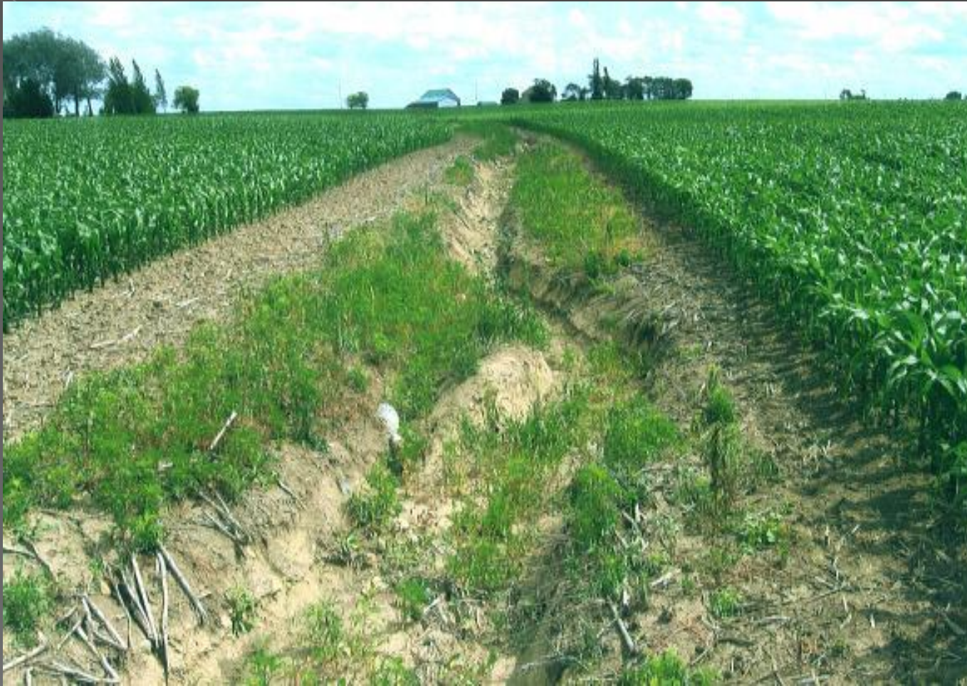
Figure 5. Gully erosion may develop in locations where rill erosion has not been managed.