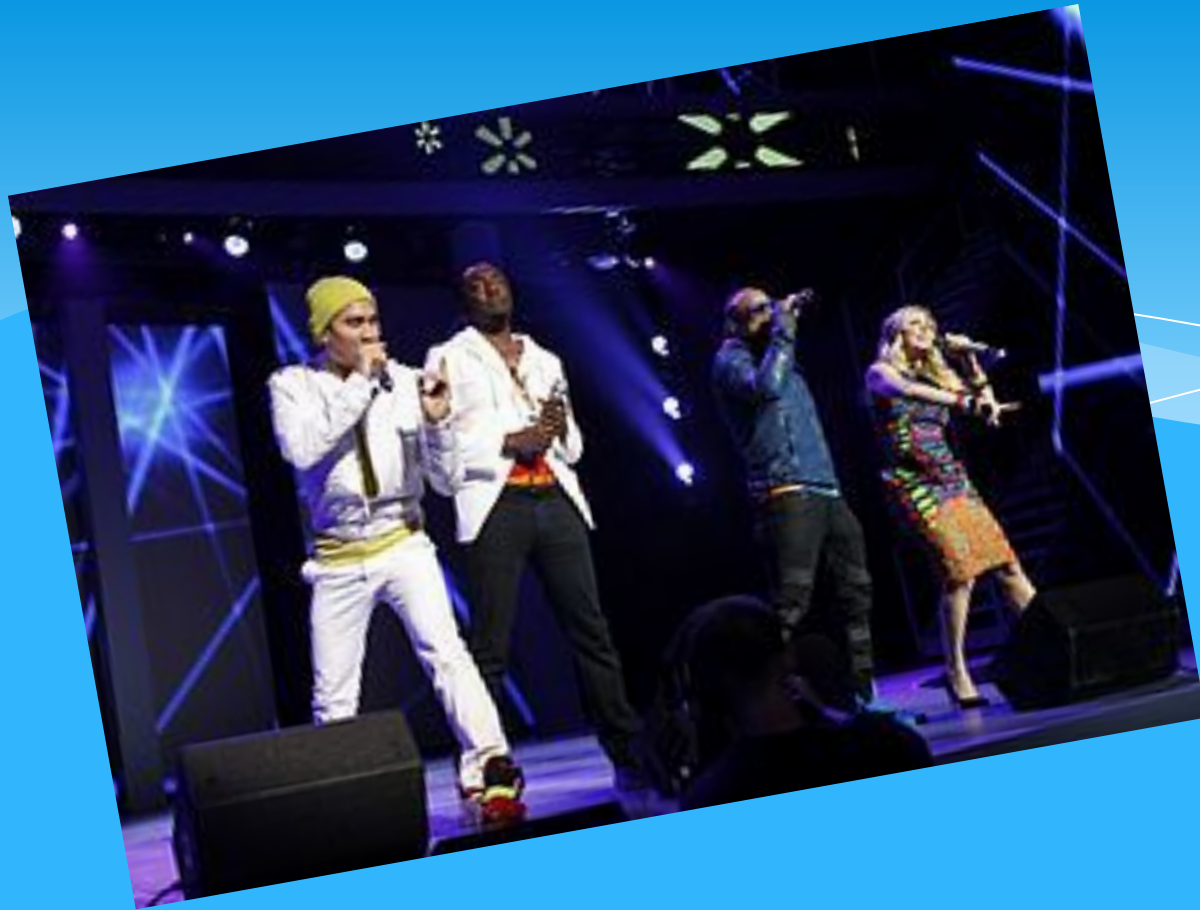
THE BLACK EYED PEAS, FROM LEFT TO RIGHT: TABOO, WILLIAM ,APL.DE.AP, AND FERGIE