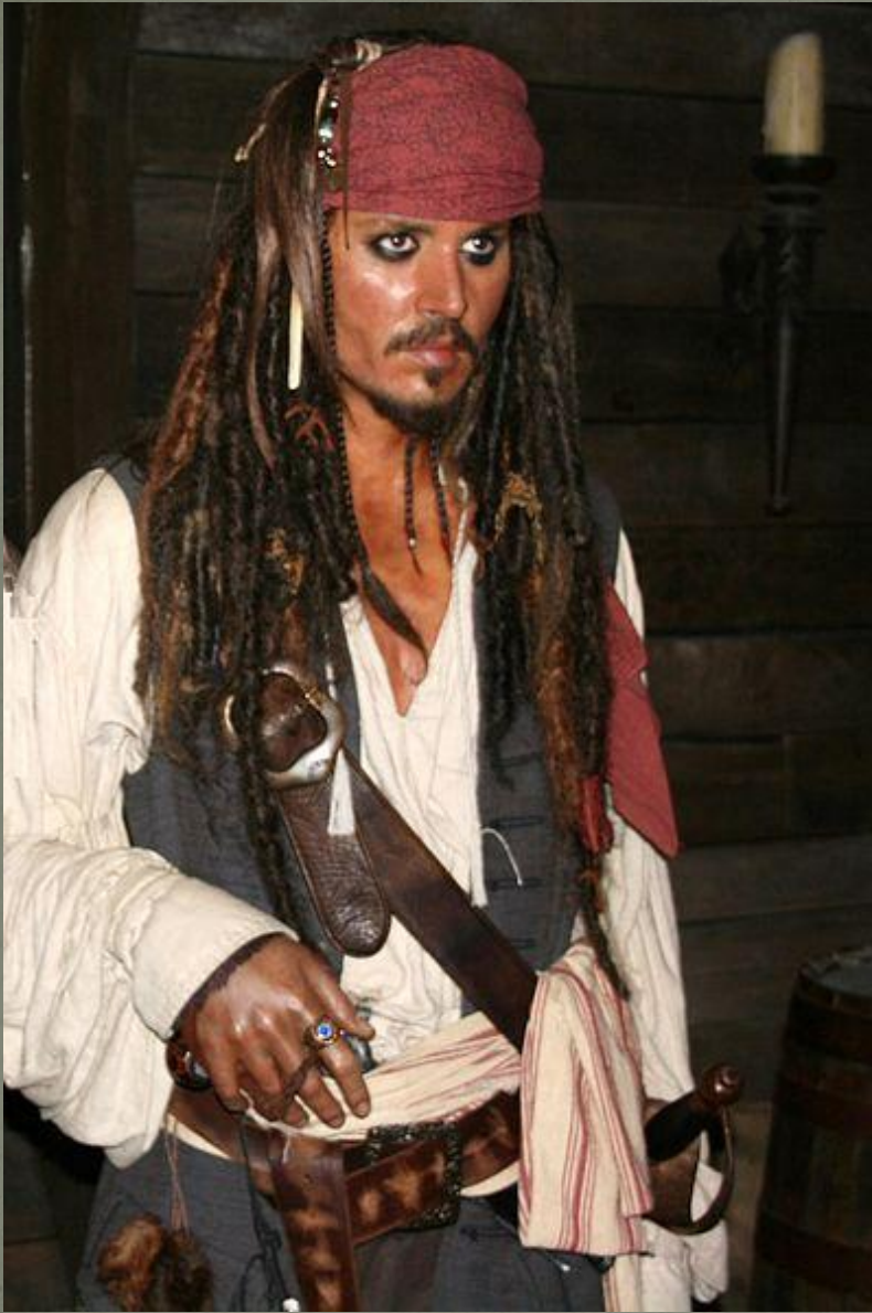
Johnny Depp as Jack Sparrow