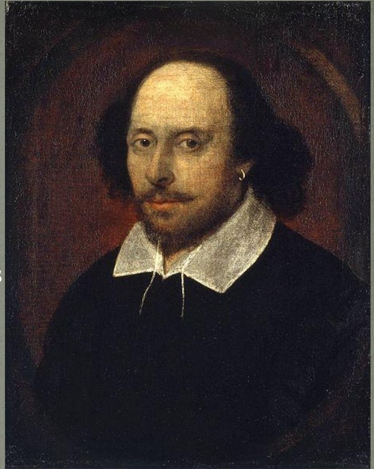
The Chandos portrait

The gallery houses portraits of historically important and famous British people, selected on the basis of the significance of the sitter, not that of the artist. The collection includes photographs and caricatures as well as paintings, drawings and sculpture. One of its best-known images is the Chandos portrait, the most famous portrait of William Shakespeare although there is some uncertainty about whether the painting actually is of the playwright.