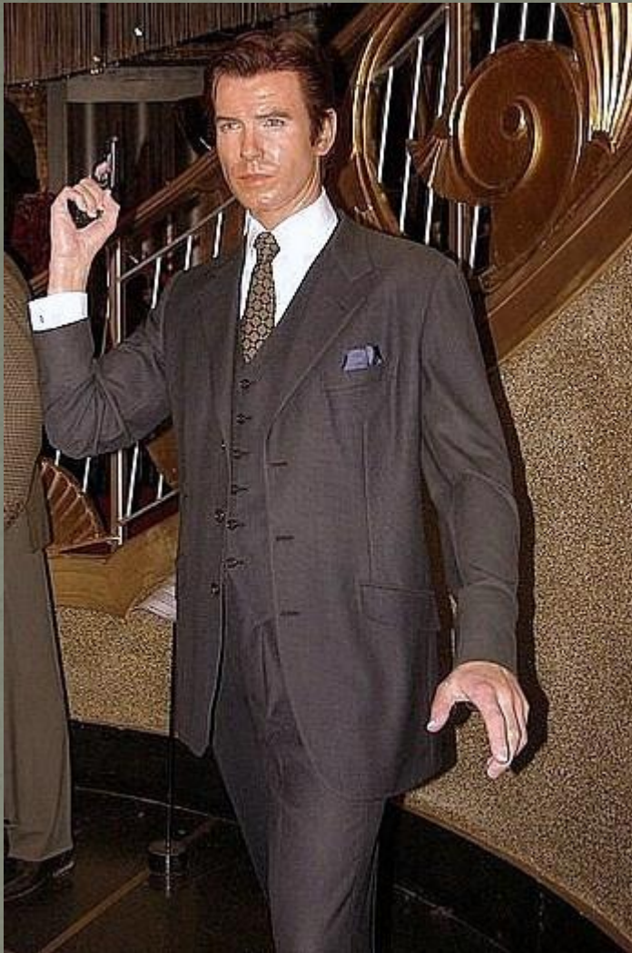
Pierce Brosnan as James Bond 007