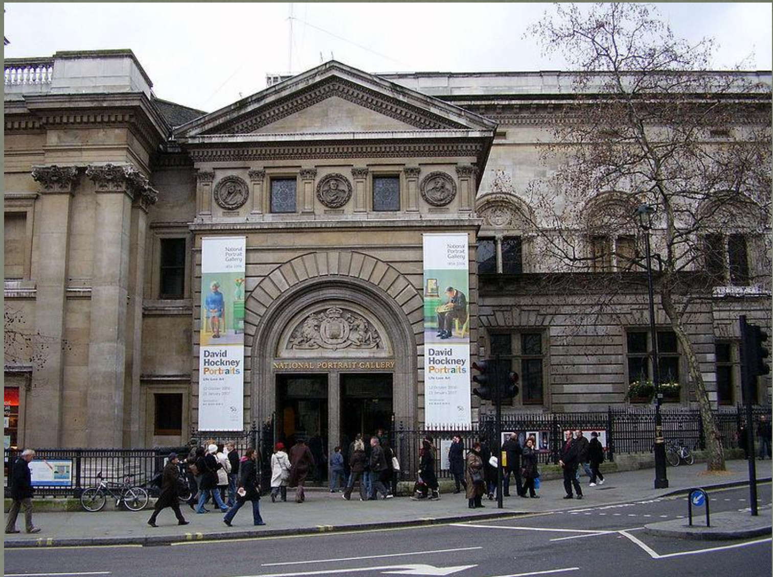
Entrance to the National Portrait Gallery