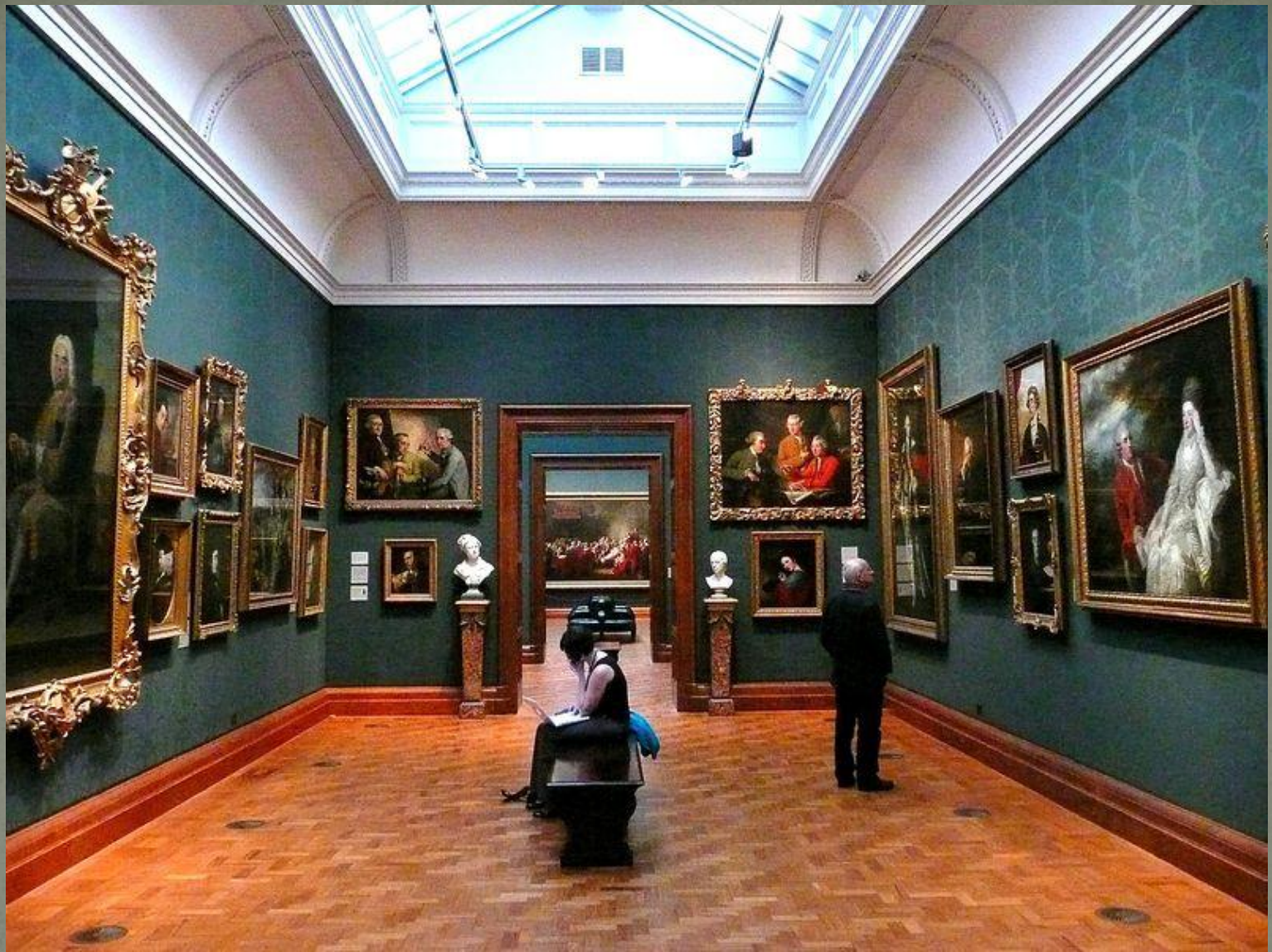
Inside the National Portrait Gallery