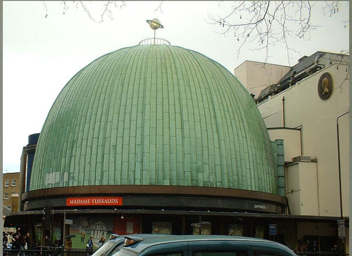
Madame Tussauds and the London Planetarium

Madame Tussauds is a wax museum in London with branches in a number of major cities. It was founded by wax sculptor Marie Tussaud and was formerly known as Madame Tussaud's. Madame Tussauds is a major tourist attraction in London, displaying waxworks of historical and royal figures, film stars, sports stars and infamous murderers.