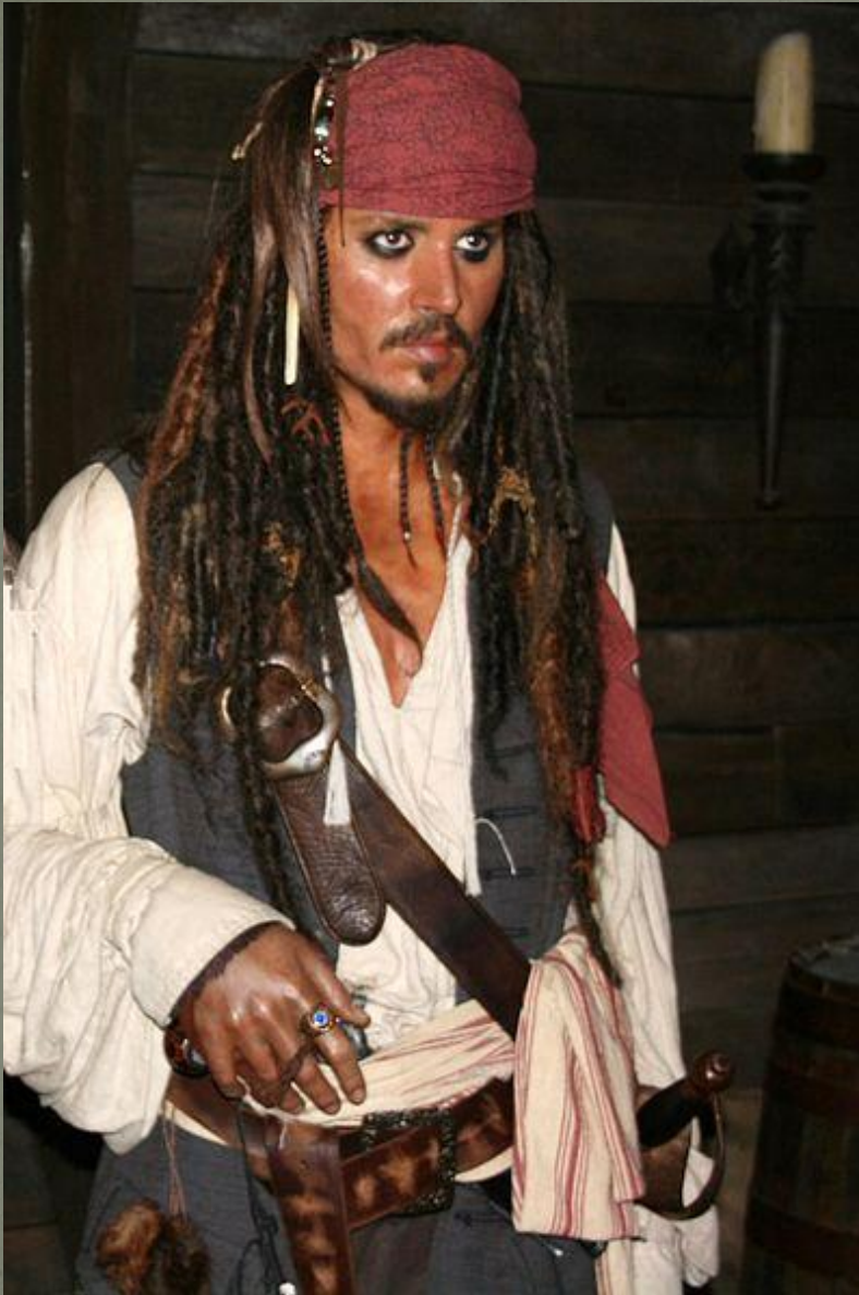
Johnny Depp as Jack Sparrow