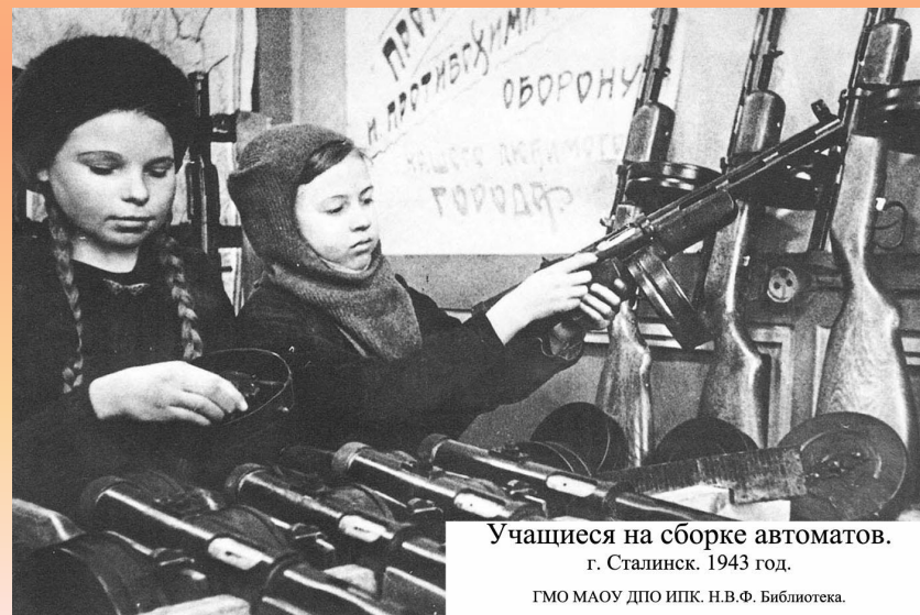
Учащиеся на сборке автоматов. г. Сталинск. 1943 год.