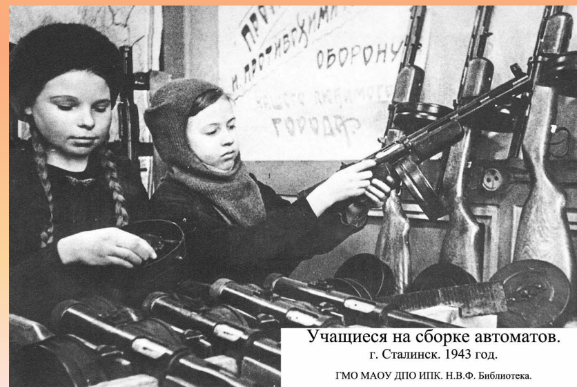
Учащиеся на сборке автоматов. г. Сталинск. 1943 год.