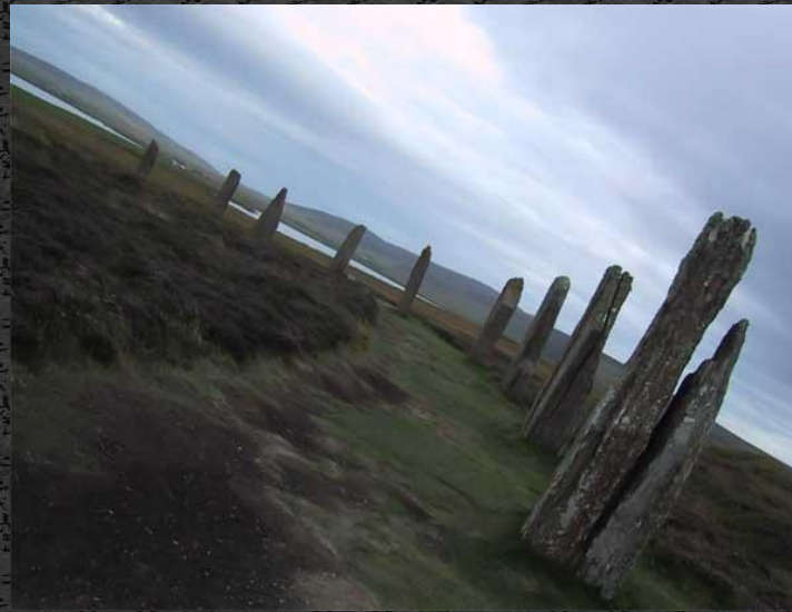
Ring of Brodgar