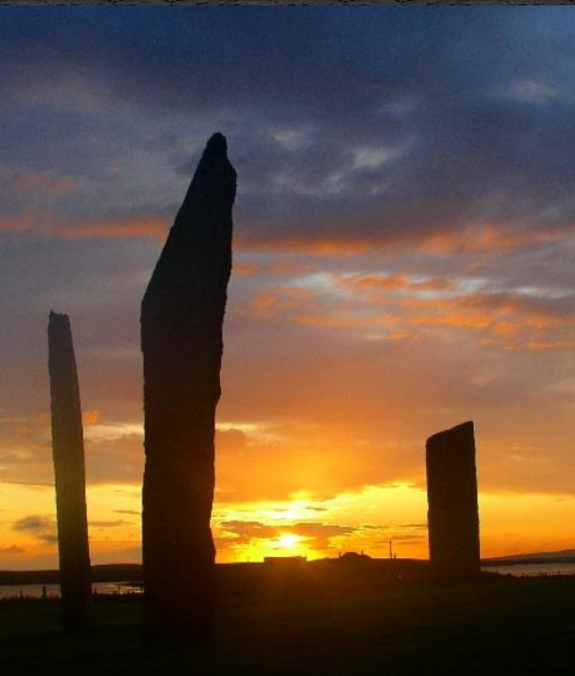
Standing Stones of Stenness