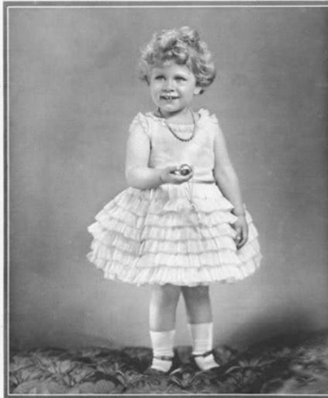
THE "GOLDEN-CRESTED 'LITTLE FRIEND OF ALL THE WORLD': PRINCESS ELIZABETH OF YORK.

Princess Elizabeth, in this charming photograph above, has just finished the day of holding highland. It is seven months since her return with her parents, the Duke and Duchess of York, on their return from Russia. Describing her as the fairest creature, Lady Cynthia Asquith wrote in her newly published book, "The Duchess of York" (issued in our last number): "Princess Elizabeth . . . knows how to smile sweetly