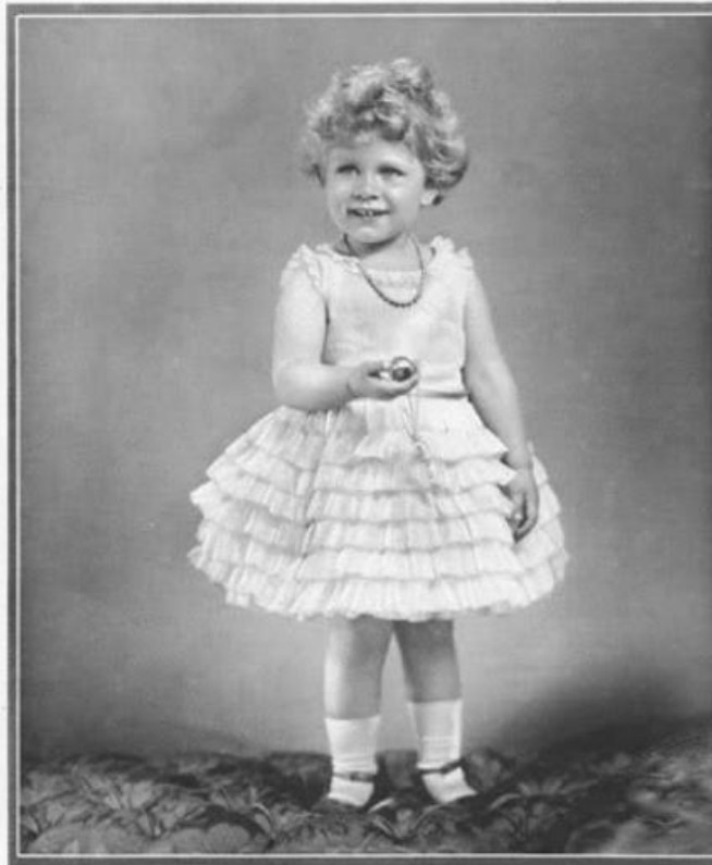
THE "GOLDEN-CRESTED 'LITTLE FRIEND OF ALL THE WORLD': PRINCESS ELIZABETH OF YORK.

The Copyright of all the Editorial Matter, both Engravings and Lithographs, is Reserved in Great Britain, All Colonies, Europe, and the United States of America.