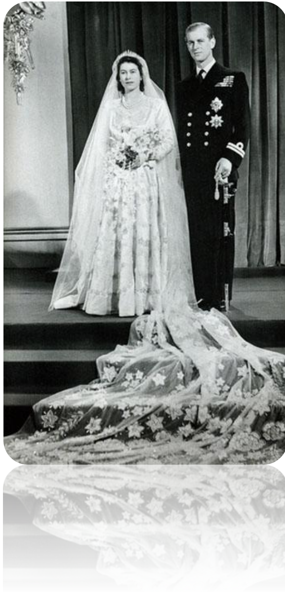
The marriage of the young Princess Elizabeth to Philip, Duke of Edinburgh took place in November 1947.