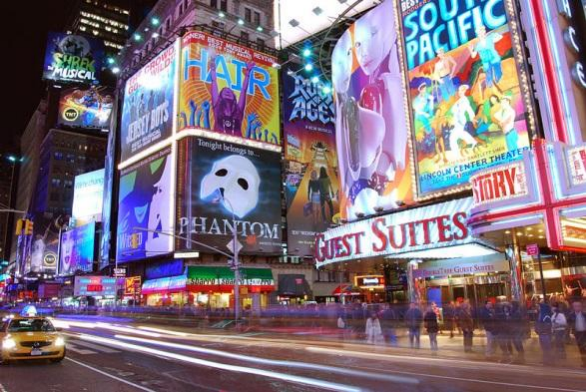
Broadway show billboards in Times Square