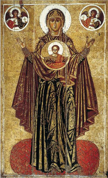
"Yaroslavl Orans", the beginning of the XIII century