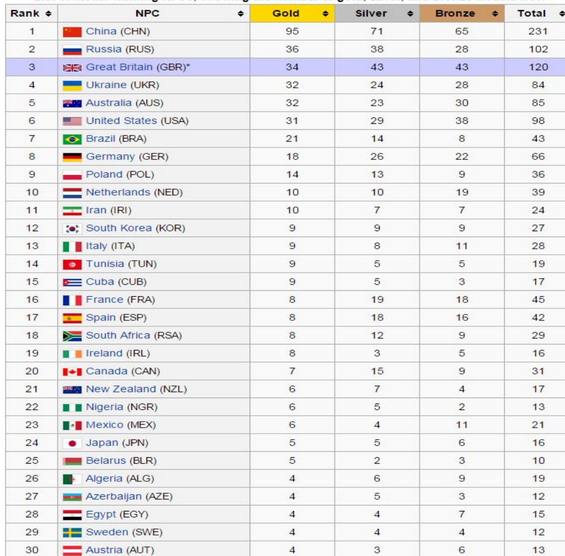
List of medal-winning NPCs, showing the number of gold, silver, and bronze medals won